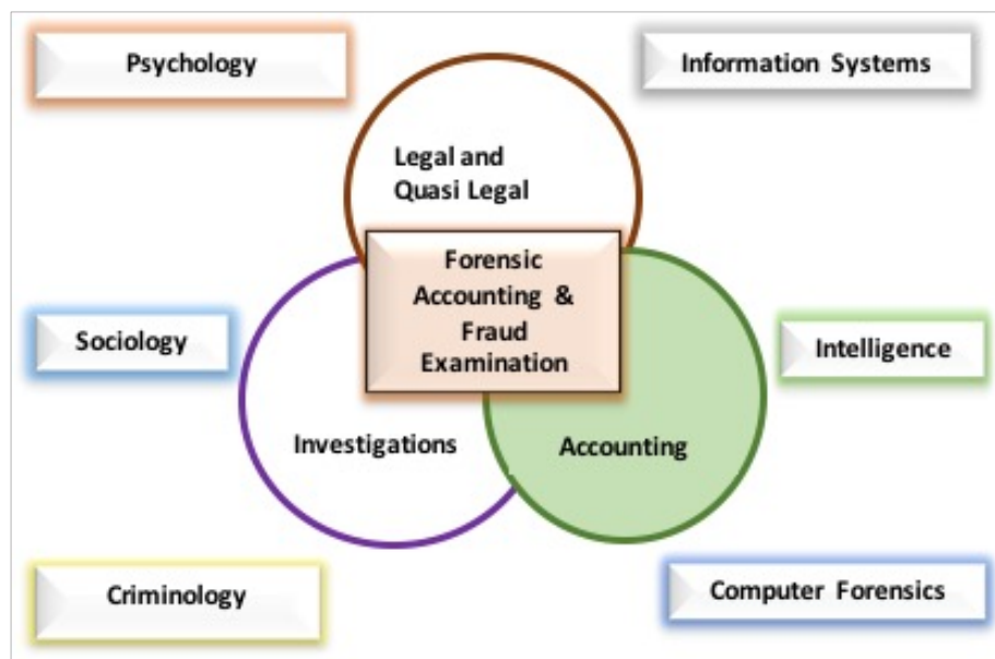
Figure 1: Requisite Skills of the African Forensic Accountant